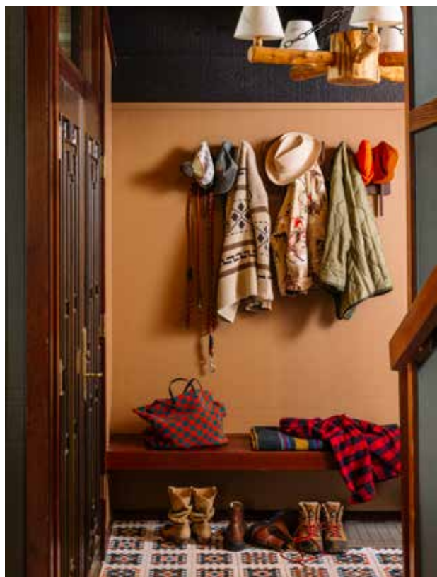
MUDROOM Nozawa gave the original built-in pine bench and cabinet doors a backdrop of Maryville Brown paint by Benjamin Moore. Flooring: Clé Tile. Coatrack: Rejuvenation.