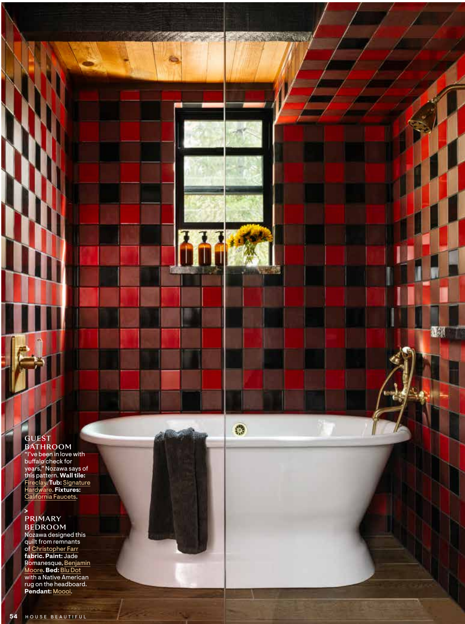
GUEST BATHROOM "I've been in love with buffalo check for years," Nozawa says of this pattern. Wall tile: Fireclay. Tub: Signature Hardware. Fixtures: California Faucets.